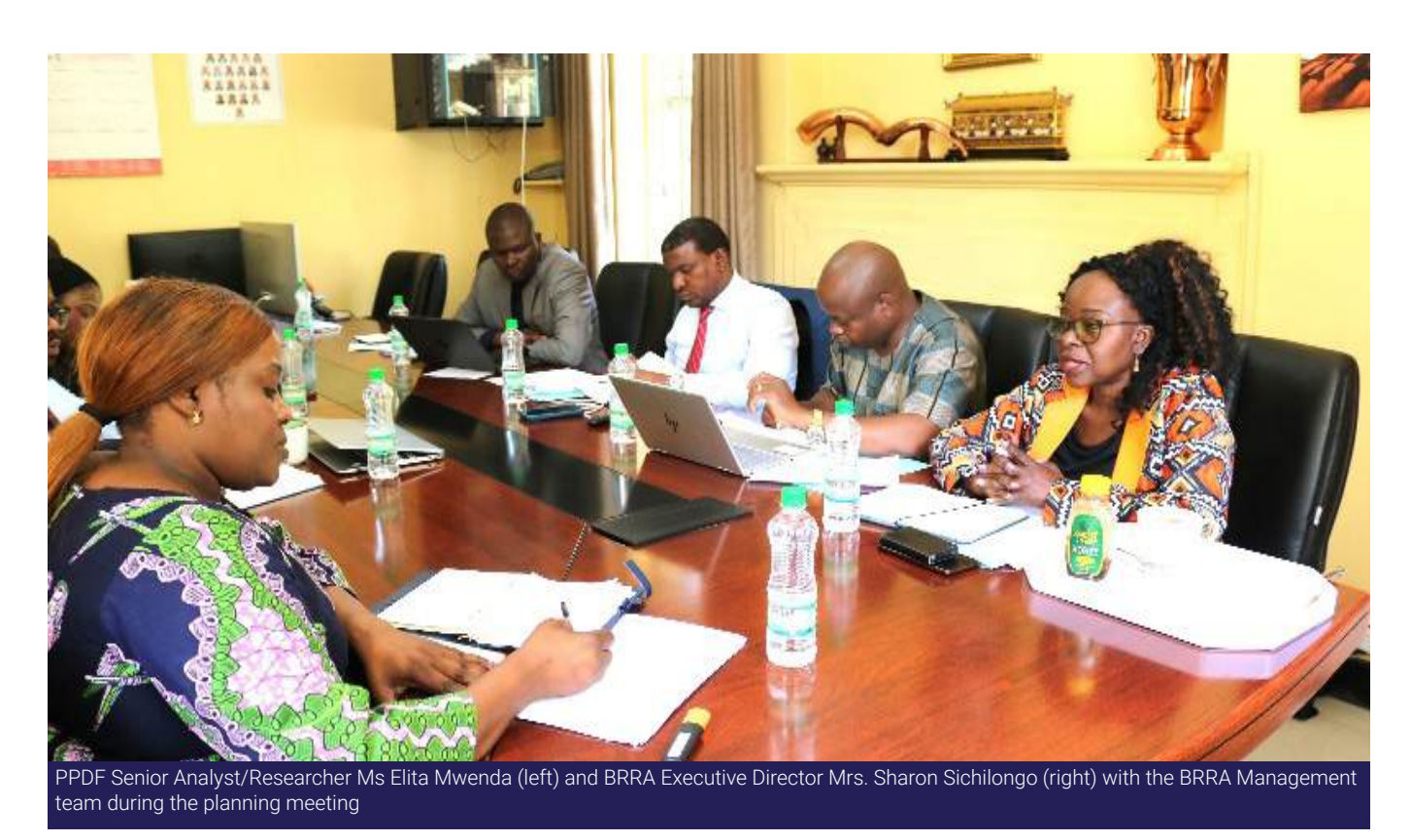
Strategic collaborations are powerful enablers that allow institutions to leverage their strengths and work towards shared objectives.

ne such partnership is the Memorandum of Understanding (MoU) between the Business Regulatory Review Agency (BRRA) and the Public Private Dialogue Forum (PPDF). This five-year agreement aims to foster a more conducive business and investment climate in Zambia.