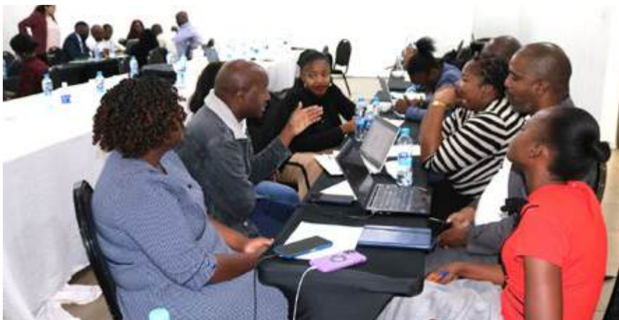
Participants during the plenary sessions

Among the regulatory agencies represented at the training were the Bank of Zambia, Chongwe Municipal Council, Competition and Consumer Protection Commission, Energy Regulation Board, Independent Broadcasting Authority, Pensions and Insurance Authority and Radiation Protection Authority.