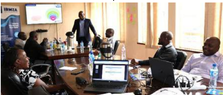
BRRRA Risk Management Focal Point Officers during the training.