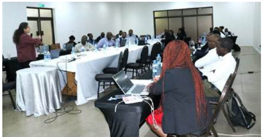
Participants during the RIA capacity building.

phasizing its significance in shaping effective policies and laws.