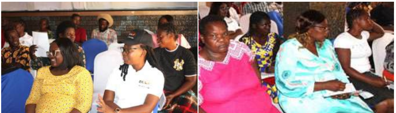
Participants during the engagement in Mumbwa

This year's commemorations were held under the theme: "Towards Beijing +30: UNITE to End Violence Against Women and Girls."