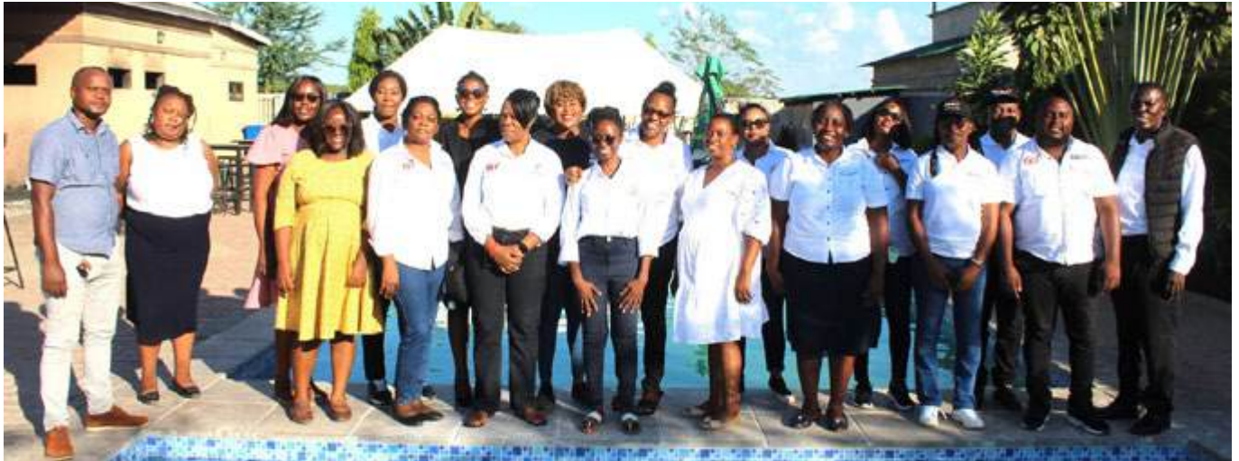
Officers from MCTI, statutory bodies under MCTI and Legal Aid Clinic for Women during the engagement in Mumbwa.

Zambia joined the global community in commemorating the 16 Days of Activism Against Gender-Based Violence (GBV), an annual international campaign aimed at raising awareness and inspiring action to end GBV.